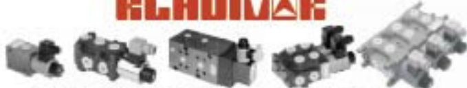
Valves sélectrice 12 vdc et 24 vdc et accessoires selector valves 12 vdc and 24 vdc and accessories