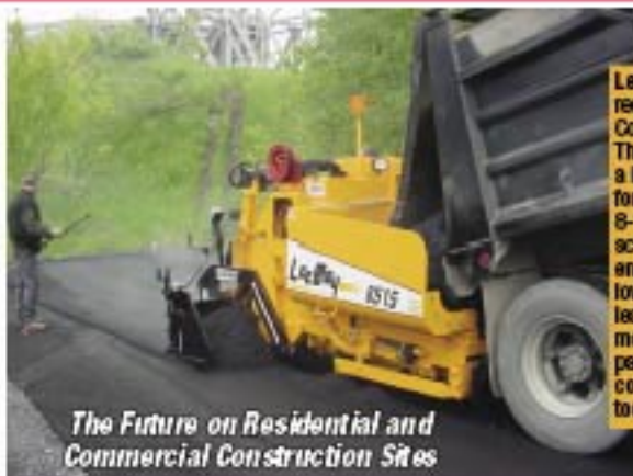
The Future on Residential and Commercial Construction Sites

LeeBoy 8515 Paver Increase productivity and reduce operating costs with LeeBoy's 8515 Conveyor Asphalt Paver. The 8515 incorporates big paver features into a heavy-duty, maneuverable package designed for production and reliability. It includes an 8-15-foot heated and vibrating Legend™ screed system, powerful 75-hp Hatz Silent Pack engine, dual operator controls and high-deck/low-deck configuration. LeeBoy, the world's leading maker of asphalt pavers, produces models from the 700B and 10000 tilt hopper pavers to the 5000, 7000, 8500, 8515 and 8816 conveyor pavers to meet the varied needs of today's paving contractor.