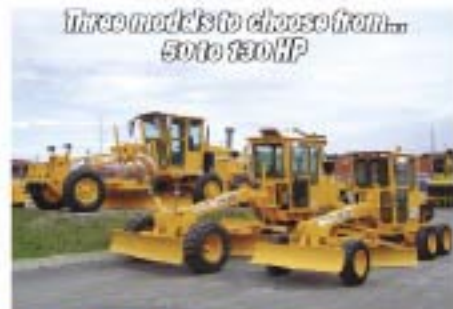
Three models to choose from... 50 to 130 HP

LeeBoy 8515 Paver Increase productivity and reduce operating costs with LeeBoy's 8515 Conveyor Asphalt Paver. The 8515 incorporates big paver features into a heavy-duty, maneuverable package designed for production and reliability. It includes an 8-15-foot heated and vibrating Legend™ screed system, powerful 75-hp Hatz Silent Pack engine, dual operator controls and high-deck/low-deck configuration. LeeBoy, the world's leading maker of asphalt pavers, produces models from the 700B and 10000 tilt hopper pavers to the 5000, 7000, 8500, 8515 and 8816 conveyor pavers to meet the varied needs of today's paving contractor.