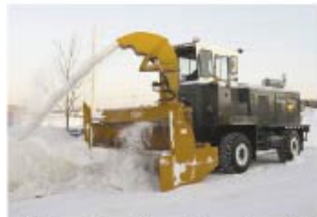
LARUE 7060 Series 226 self-propelled hydrostatic drive, Detroit Diesel Series 60 533 HP engine