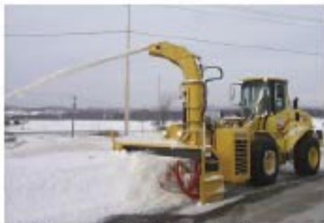
LARUE D55 detachable loader mount, mechanical drive, 300 HP, 8500 lbs, 36 in. ribbon auger, 40 in. impeller, telescopic chute