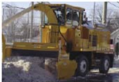
LARUE T60 R36 self-propelled hydrostatic drive, Cat C9 350 HP engine, 36 in. ribbon auger, 40 in. impeller, telescopic chute