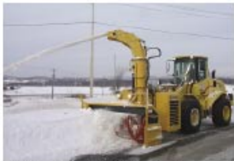
LARUE D55 detachable loader mount, mechanical drive, 300 HP, 8500 lbs, 36 in. ribbon auger, 40 in. impeller, telescopic chute