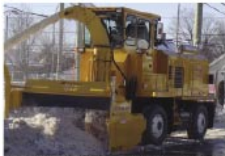
LARUE T60 R36 self propelled hydrostatic drive, Cat C9 350 HP engine, 36 in. ribbon auger, 40 in. impeller, telescopic chute