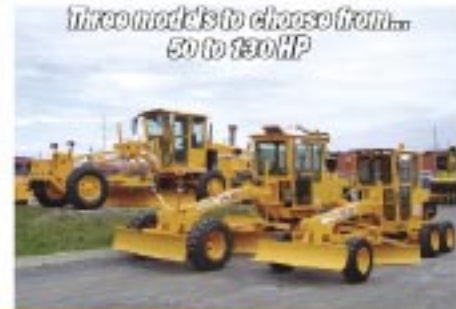
Three models to choose from... 50 to 130 HP

LeeBoy 8515 Paver Increase productivity and reduce operating costs with LeeBoy's 8515 Conveyor Asphalt Paver. The 8515 incorporates big paver features into a heavy-duty, maneuverable package designed for production and reliability. It includes an 8-15-foot heated and vibrating Legend™ screed system, powerful 75-hp Hatz Silent Pack engine, dual operator controls and high-deck/low-deck configuration. LeeBoy, the world's leading maker of asphalt pavers, produces models from the 700B and 10000 till hopper pavers to the 5000, 7000, 8500, 8515 and 8516 conveyor pavers to meet the varied needs of today's paving contractor.