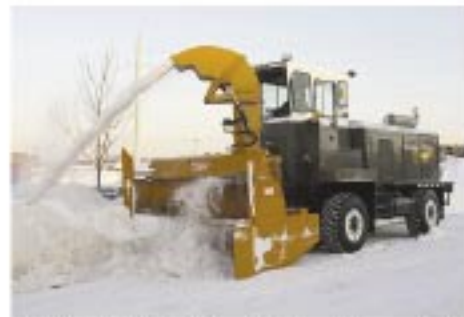
LARUE 7060 Series 226 self propelled hydrostatic drive, Detroit Diesel Series 60 533 HP engine