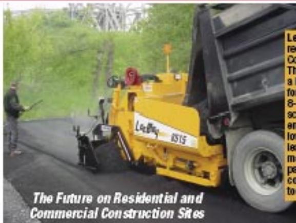
The Future on Residential and Commercial Construction Sites

LeeBoy 8515 Paver Increase productivity and reduce operating costs with LeeBoy's 8515 Conveyor Asphalt Paver. The 8515 incorporates big paver features into a heavy-duty, maneuverable package designed for production and reliability. It includes an 8-15-foot heated and vibrating Legend™ screed system, powerful 75-hp Hatz Silent Pack engine, dual operator controls and high-deck/low-deck configuration. LeeBoy, the world's leading maker of asphalt pavers, produces models from the 700B and 10000 till hopper pavers to the 5000, 7000, 8500, 8515 and 8516 conveyor pavers to meet the varied needs of today's paving contractor.